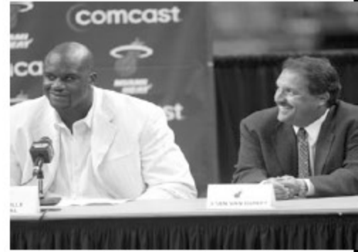
Shaquille O'Neal looks to lead the Miami Heat to a promising season.